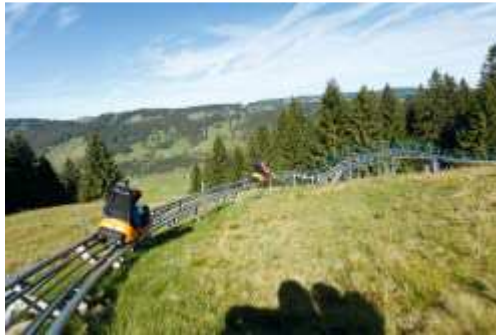
Alpsee Coaster in floodlights

Opening times: 11.07. - 06.09. Chairlift and climbing-forest 09:00 - 19:00 / Alpsee Coaster: 09:30 - 19:00 The Alpsee Coaster is Germany's longest all-season toboggan run and in almost any weather into operation. At a length of nearly 3,000 meters, the distance from the upper station of the chairlift leads directly to the "toboggan host" beside the station.