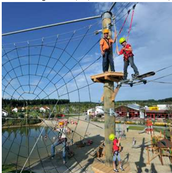
Hochseilgarten im LEGOLAND®

Location: Legoland www.legoland.de/de/LEGOLAND-Feriendorf/Hochseilgarten/